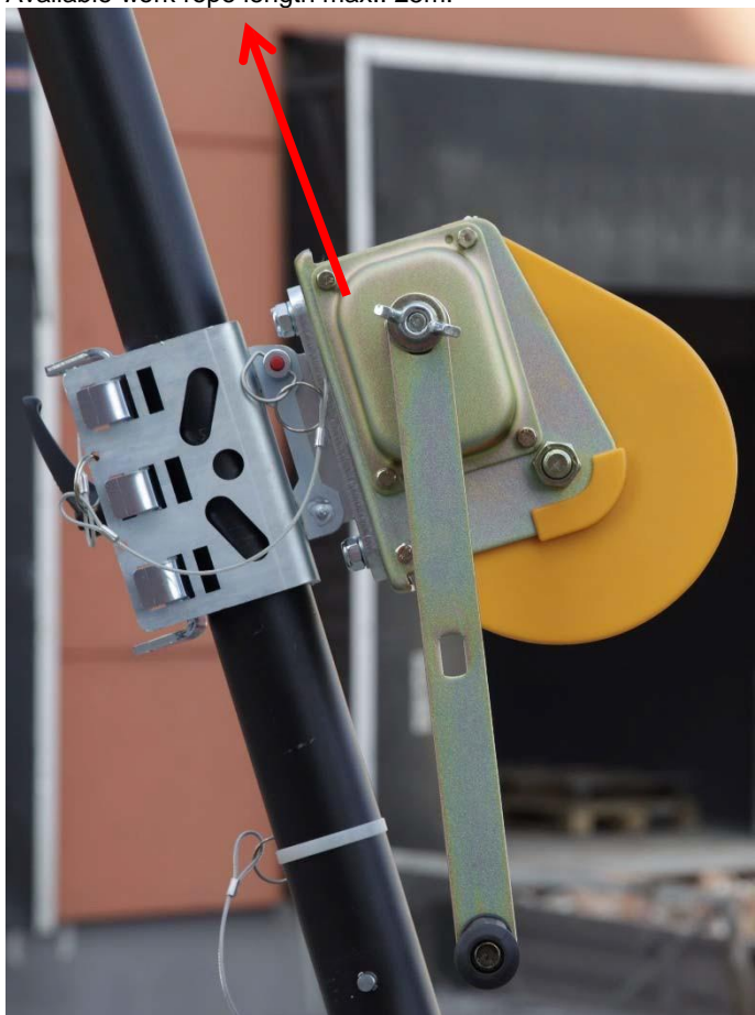
Figure 2 - Permissible load direction