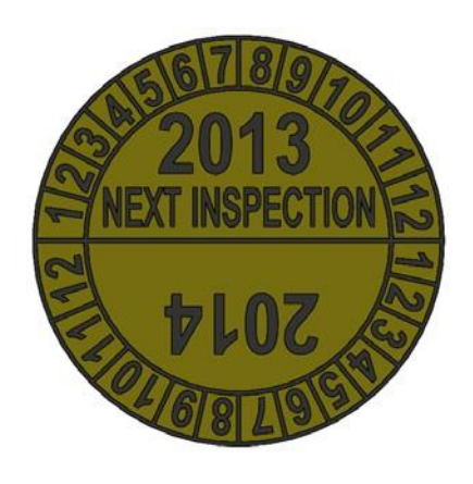
Figure 6 - "Next inspection" sticker

"Next inspection" sticker should be affixed near identity label and it is necessary to mark month and year of the next periodic inspection. Do not use the device after this date.