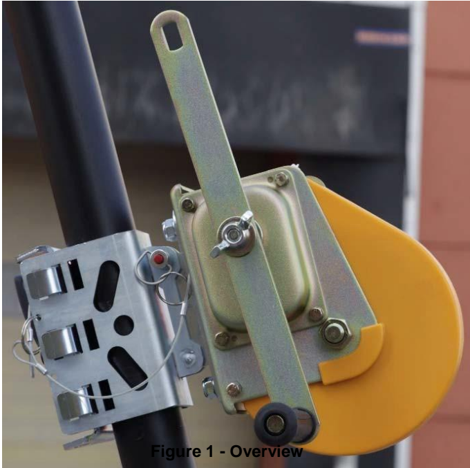
Figure 1 - Overview