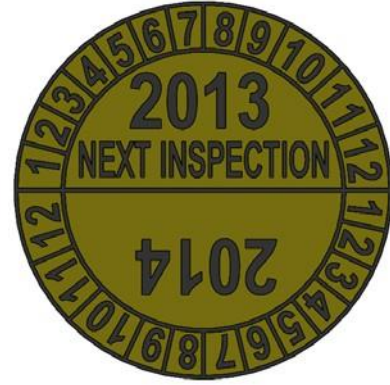
Figure 6 – “Next inspection” sticker

“Next inspection” sticker should be affixed near identity label and it is necessary to mark month and year of the next periodic inspection. Do not use the device after this date.